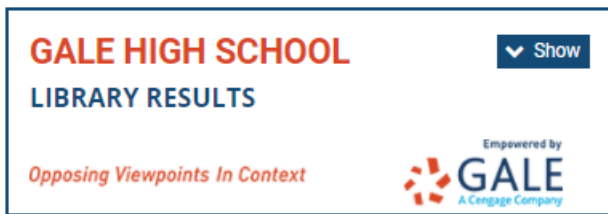
Default Collapsed View

As a result of how usage is recorded, usage reports will initially reflect an increase in Searches and Sessions.